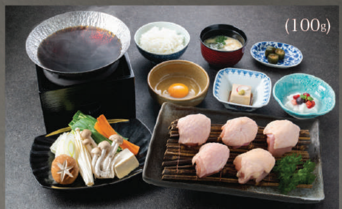
Sukiyaki Set (Chicken) 250kr