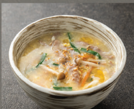
Japanese Rice Soup 110K