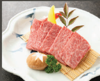
Kuri 450K (100g)