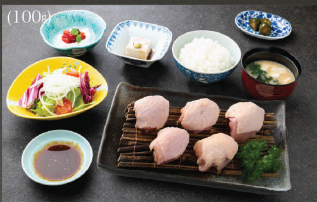
BBQ Chicken Set 280K (100g)