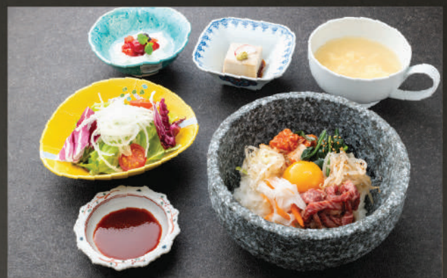
Set Bibimbap 160K