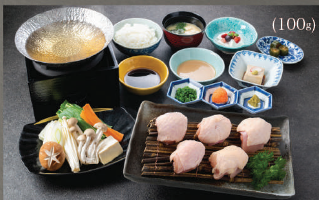
Shabu Shabu Set (Chicken) 250kr