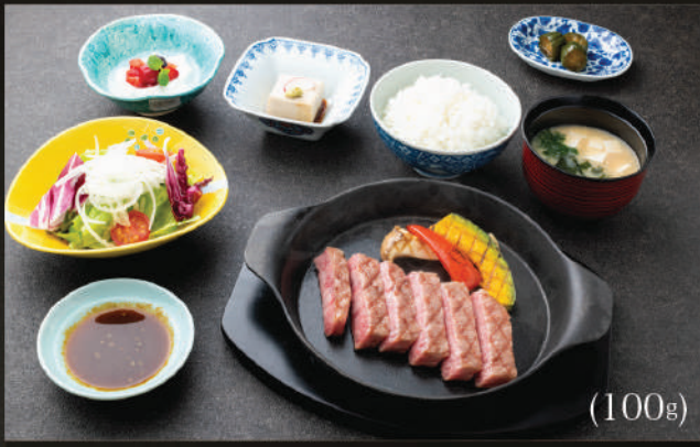
Wagyu Premium Steak Set 580K (100g)