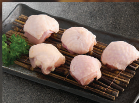
Chicken Thigh 200K (100g)