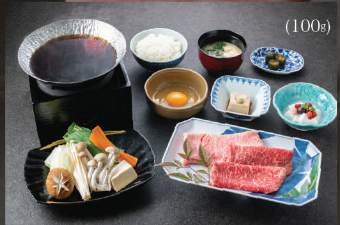
Sukiyaki Set (Wagyu) 450kr