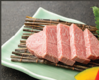
Misuji 480K (100g)