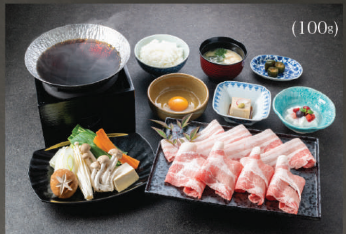
Sukiyaki Set (Hokkaido Pork) 350kr