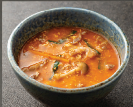
Japanese Spicy Rice Soup 120K