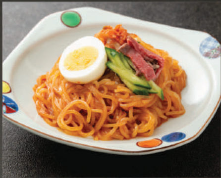
Bibim Noodles 120K