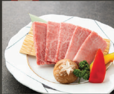
Sirloin 880K (100g)