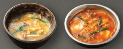
Vegetable Soup 70K