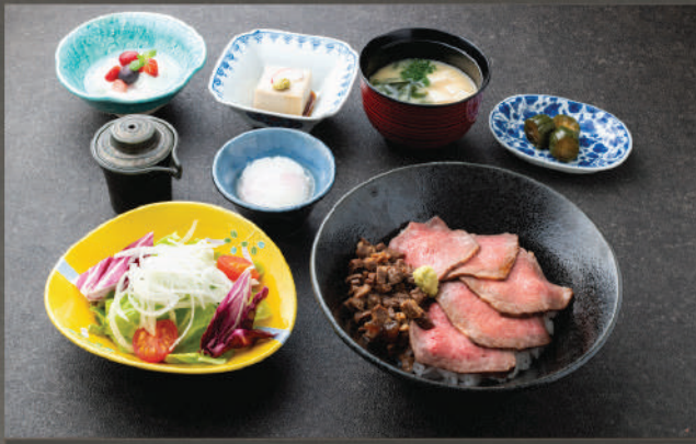
Roast Beef Rice Bowl 250K