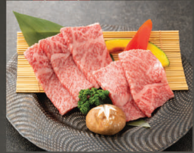
Ichibo 580K (100g)