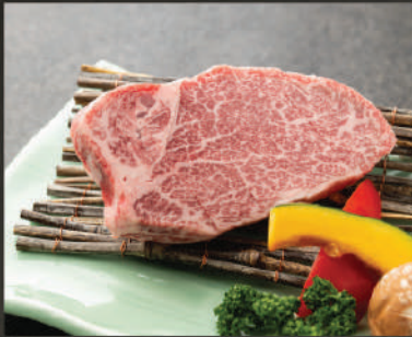
Tenderloin 980K (100g)