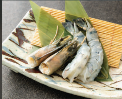
Large Prawn 200K