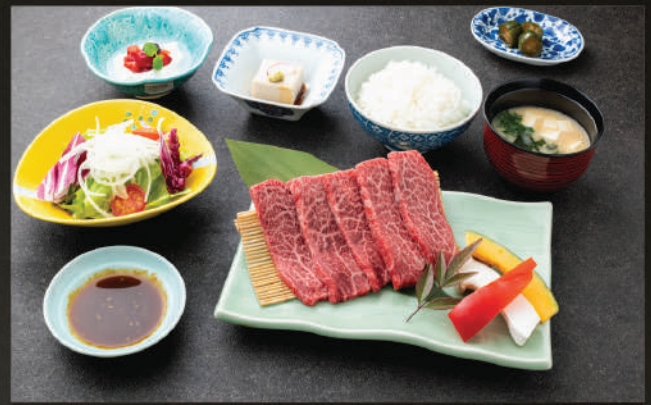
BBQ Wagyu Lean Meat Set 380K