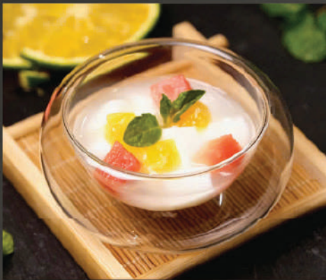
Creamy Fruit Jelly 80κ