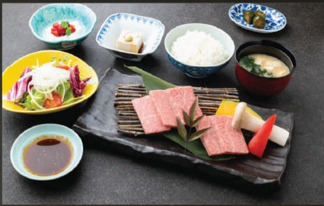
BBQ Wagyu Premium Meat Set 480K