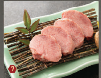
Tongue Root Thick Cut 580K (100g)