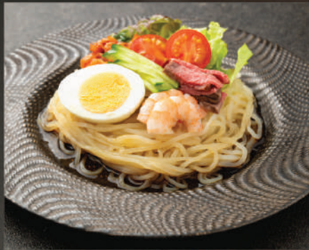
Cold Noodles 120K