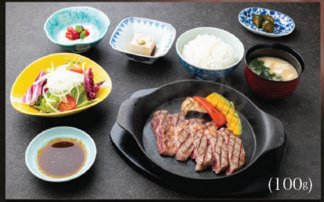
Wagyu Lean Steak Set 480K (100g)