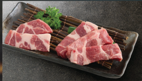
Hokkaido Pork Shoulder Loin 300K (100g)