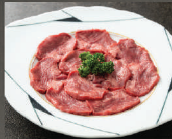
Tongue Root 520K (100g)