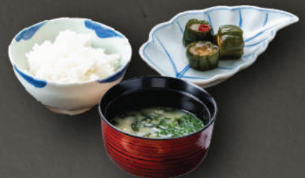
Rice Set 60K Rice, Miso Soup, Pickles