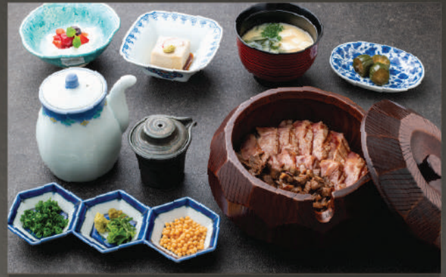
Set Hitsumabushi 300K