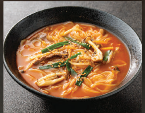
Spicy Noodle Soup 120K