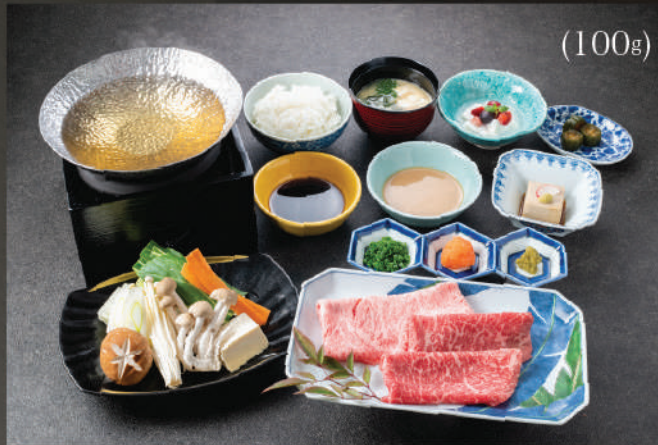
Shabu Shabu Set (Wagyu) 450kr