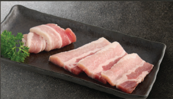
Hokkaido Pork Short Plate 280K (100g)