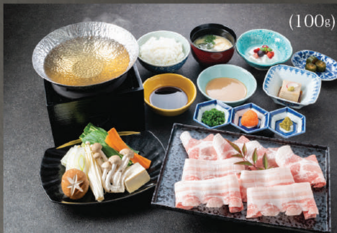
Shabu Shabu Set (Hokkaido Pork) 350kr